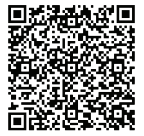
Customer Service Representative